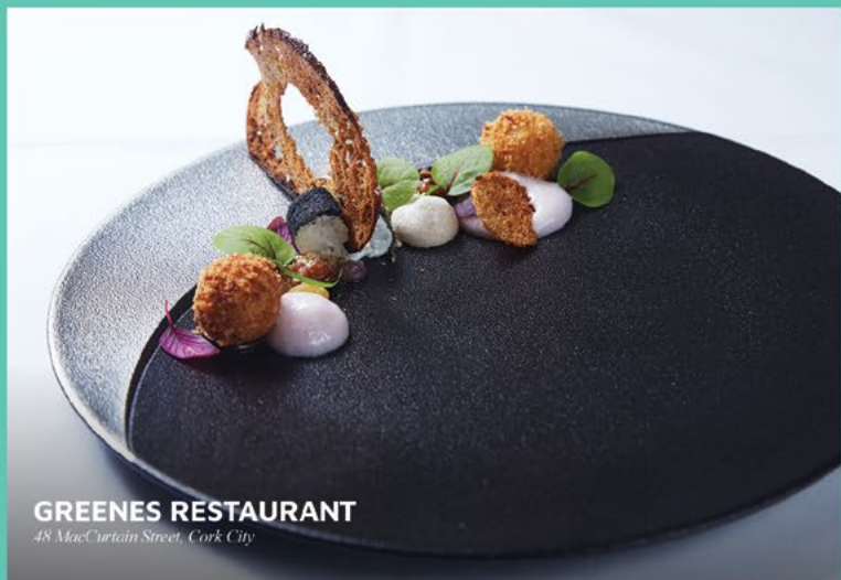
GREENES RESTAURANT 48 MacCurtain Street, Cork City