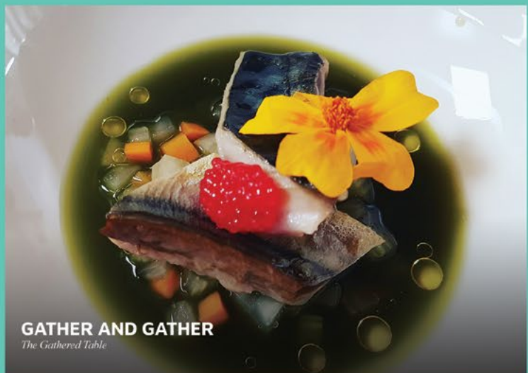
GATHER AND GATHER The Gathered Table