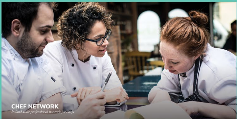
CHEF NETWORK Ireland-wide professional network for chefs