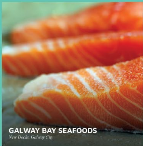
GALWAY BAY SEAFOODS New Docks, Galway City