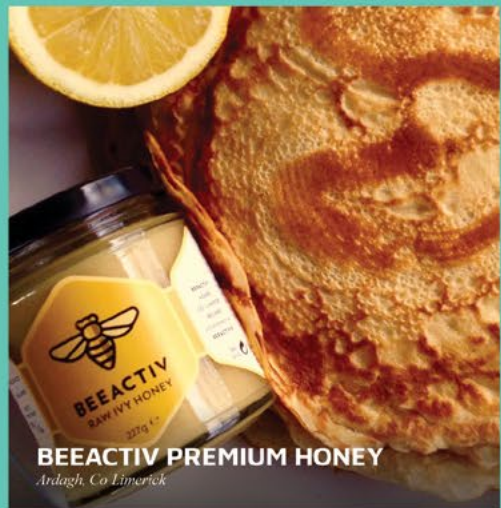
BEEACTIV PREMIUM HONEY Ardagh, Co Limerick