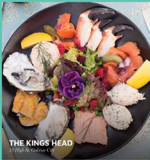
THE KINGS HEAD 15 High St, Galway City