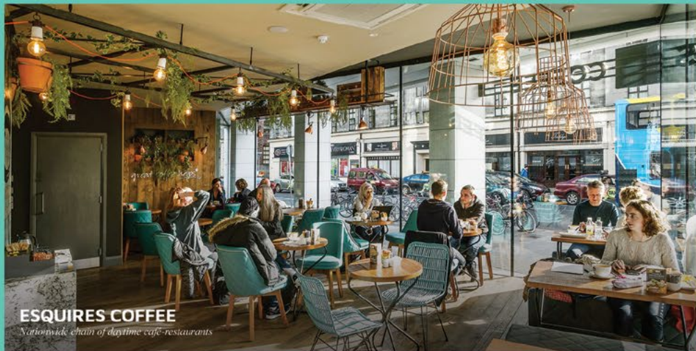
ESQUIRES COFFEE Nationwide chain of daytime cafe-restaurants