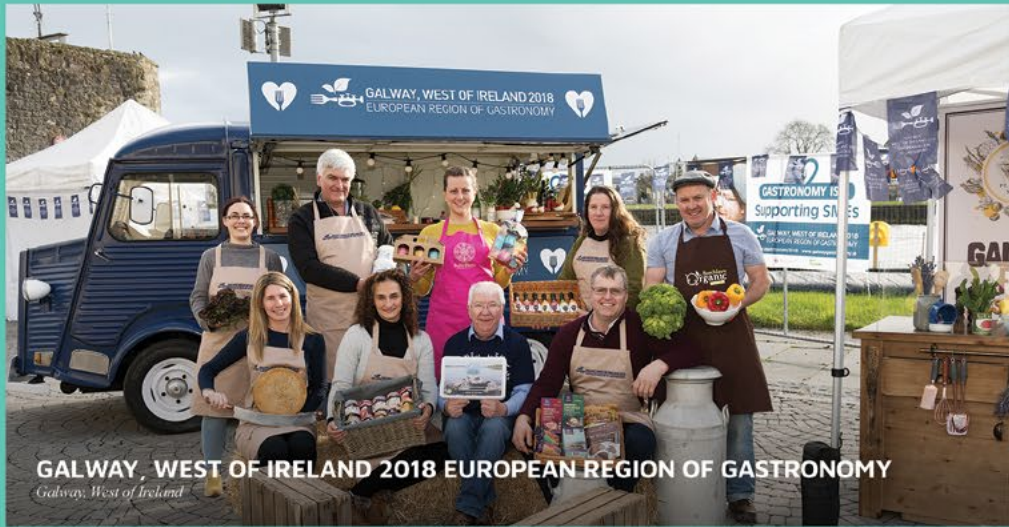
GALWAY, WEST OF IRELAND 2018 EUROPEAN REGION OF GASTRONOMY Galway, West of Ireland